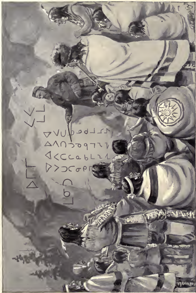
GOD ON THE ROCK.